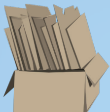
Cardboard boxes flattened

All food and drink items should be clean and dry before being placed in the recycling container.