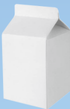
Cardboard containers free from food waste