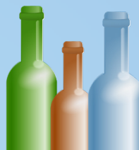
Glass of all colors