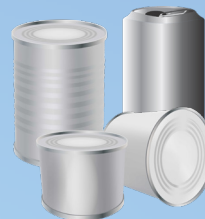
Aluminum and metal cans free from food waste