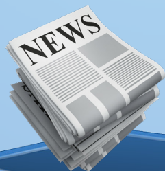
Newspaper and magazines

DO NOT place plastic bags in your City recycling container. Take bags to a grocery store that collects them for recycling.